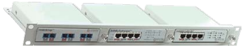
Optional 3-Unit Rack Mount

Datacom Systems' SINGLEstream™ 200 Series SPAN Aggregation Tap provides a secure solution for combining the network traffic from two SPAN ports into one single stream of data.