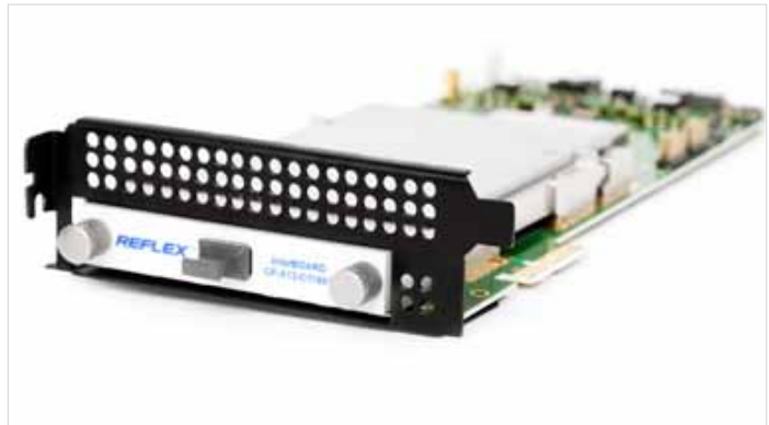
Above is our latest product release - the new 100G module.