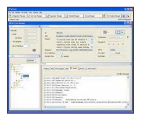
Figure 2. ATTEST Test Manager provides information on test cases